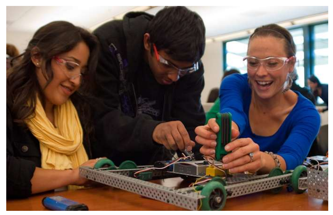
By Hoodr (Own work) [CC-BY-SA-3.0 (http://creativecommons.org/licenses/by-sa/3.0)], via Wikimedia Commons